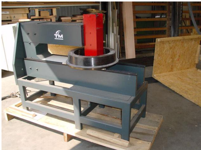
Heating up train wheel \varnothing 600 / 400 x 150 80Kg 10 minutes 220°C